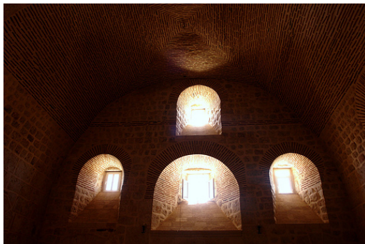
Kloster Mor Gabriel (innen)