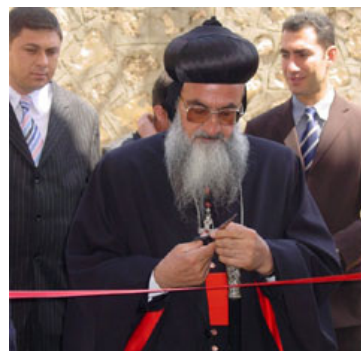
Bischof Mor Timotheus Aktas bei der Einweihung eines neuen Kulturvereins in Tur Abdin